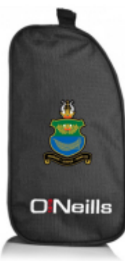
Boot bag £11