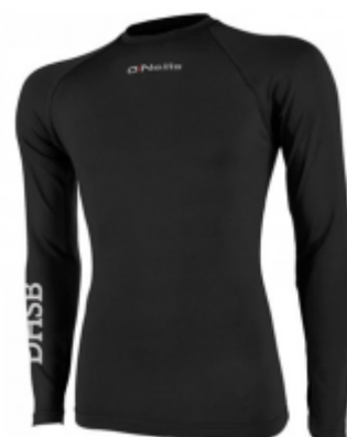
Baselayer £21 / £25