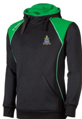
Hoody £27.50 / £32