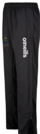
Kiwi regular track trousers £25 / £30