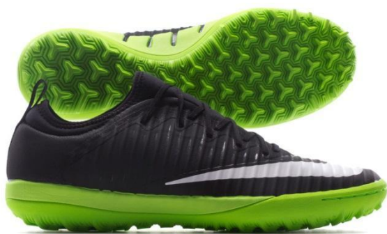
Astroturf Trainer (rubber sole with dimpled profile)