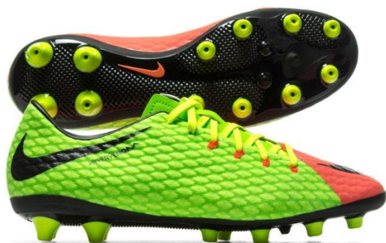
Football boots with round plastic moulded studs