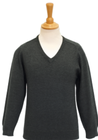
School jumper with embroidered badge £15.50 / £17 / £19