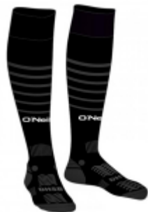
Sports socks £9 / £10

The shirts and shorts can be mix and matched with each other.