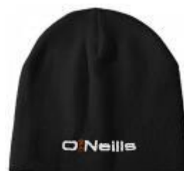
Beanie hat £7