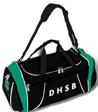
DHSB sports bag £32