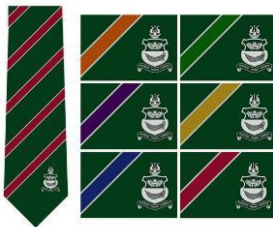
House tie £6.50