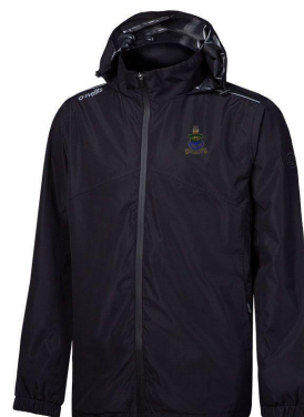
Rain jacket £30 / £38