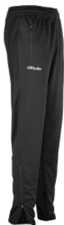
Durham skinny track trousers £24.50 / £30