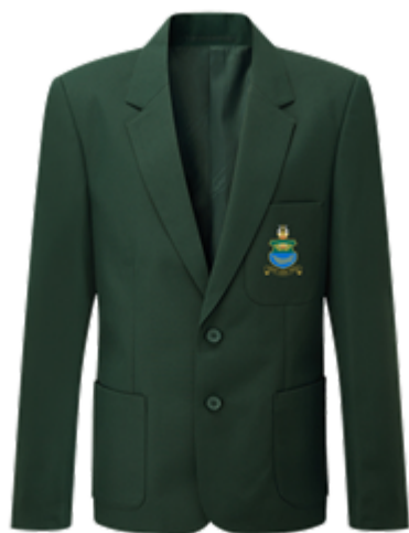
Green blazer £35 / £40