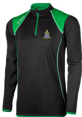
Half zip training top £27.50 / £32