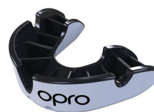
Opro Silver mouthguard (A mouthguard can be purchased from elsewhere) £11